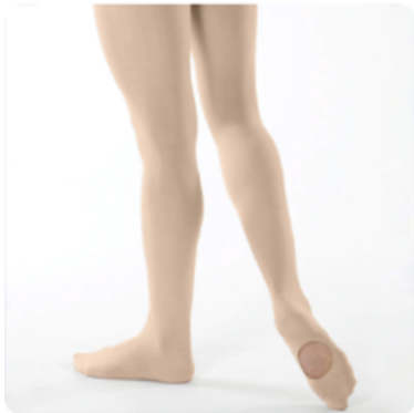
CONVERTIBLE TIGHTS (Pink) - $18.99 + tax