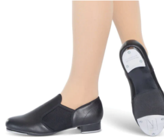
REVOLUTION TAP SHOES - $59.95 + tax

Optional extras for Jazz/acro/musical theatre/tap: