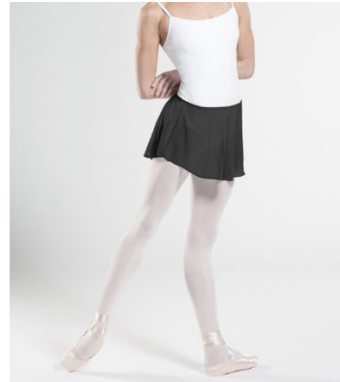
DAPHNE BALLET SKIRT - $45.00

***Note that Wear Moi merchandise has tax included and will be added to your Dance Studio Pro account and an E-transfer payment needs to be made the same day to amanda@giftofdancecanada.com to secure your order.