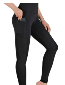
OPTIONAL LEGGINGS - $44.95+ tax - $49.95+ tax