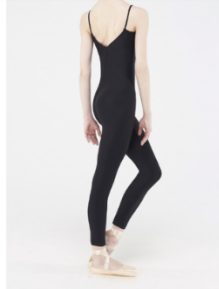
OPTIONAL KASSY UNITARD – FRONT & BACK $70/$80