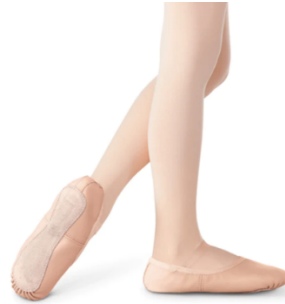
REVOLUTION BALLET SLIPPERS - $31.95 + tax