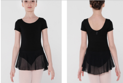
ADAGE DRESS – FRONT AND BACK - $40.00