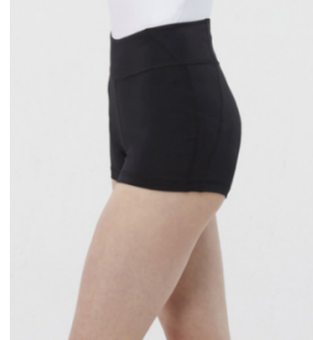
ARIELLE SHORTS - $45