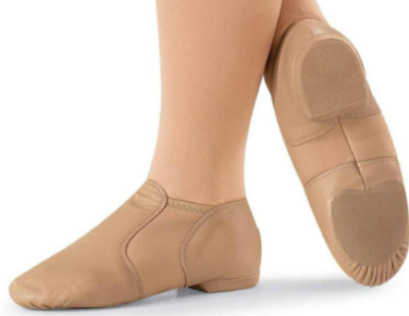
CAPEZIO JAZZ SHOES - $58.00 + tax.